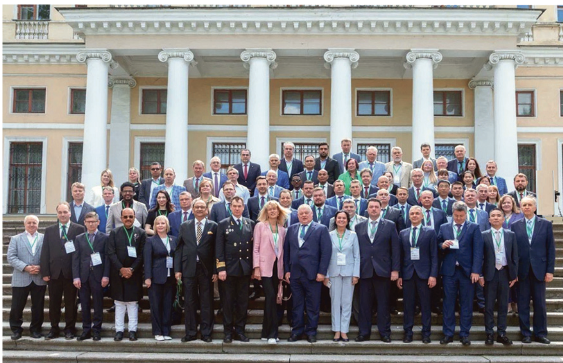
Participants of the conference at the Yusupov Palace. June 10, 2024. Photo by V. Korovyakovsky

St. Petersburg. The Yusupov Palace on the embankment of the Fontanka River 1 is the cradle of Russian transport education and science. It is the first building of the Institute of the Corps of Railway Engineers. Currently, the building houses classrooms and the historical and cultural centre of Emperor Alexander I St. Petersburg Transport University (PGUPS). The III Conference of the Association of Rectors of Transport Universities of BRICS+ took place here on June 10–11, 2024. Photo by V. Korovyakovsky