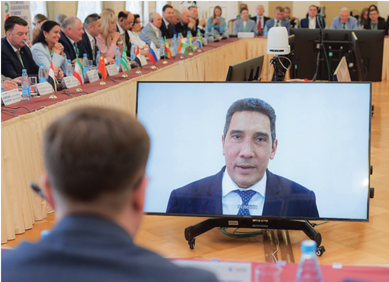
Eduardo Rodríguez Dávila, Minister of Transport of the Republic of Cuba, is greeting the Conference participants via video link