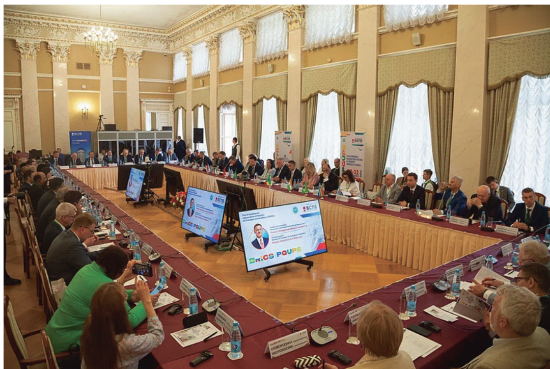
Conference room of the III Conference of the Association of Rectors of Transport Universities of BRICS+. Yusupov Palace on Fontanka Embankment. PGUPS. St. Petersburg June 10, 2024.

interested players in the transport sector to discuss important issues related to the development of transport and logistics for the improvement of logistics connectivity between the countries of the association. To date, about 100 organizations have taken part in the meetings of the Subgroup. These include not only transport and logistics companies, but also educational institutions, research organizations in the field of transport and logistics, and sector-specific universities. The Subgroup on Transport and Logistics of the BRICS Business Council supported holding the III Conference of the Association of Rectors of Transport Universities of BRICS+ as one of its formal events.