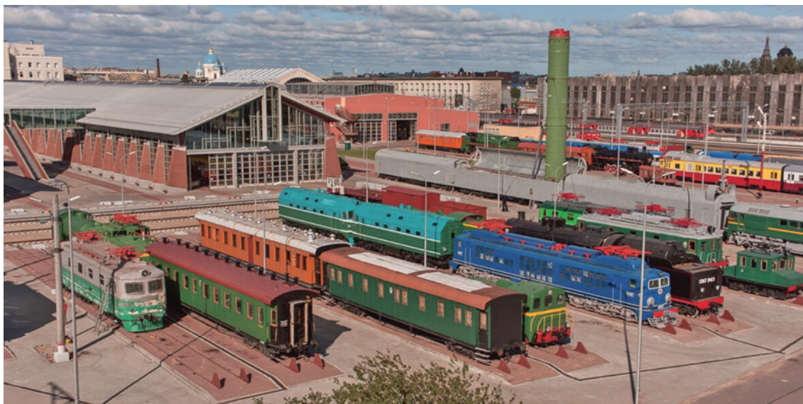
General view of the Museum of Railways of Russia. Photo of the Museum of Railways of Russia

On July 11, the final meeting of the Conference was held at the Museum of Railways of Russia. The meeting discussed proposals on the work plan for the coming year and in the future. Proposals on the time and venue of the next IV conference of the Association of BRICS Transport Universities were considered.