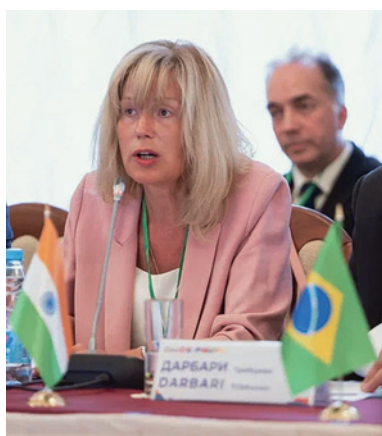
Irina Yu. Ganus, acting Chairperson of the Committee for Science and Higher Education of the Government of St. Petersburg, is greeting the Conference participants.