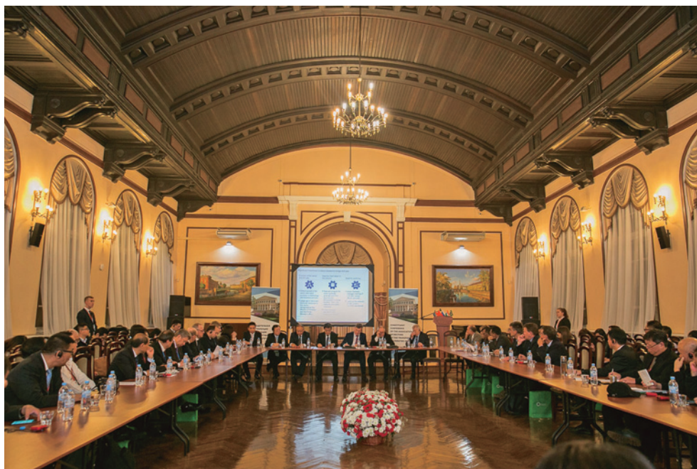
Conference room of the Constituent Conference of the Association of Rectors of Transport Universities of BRICS+. St. Petersburg, PGUPS. November 13, 2018.

The preparation work took several years, when representatives of various educational institutions exchanged their opinions, entered into bilateral agreements, held conference, exchange visits, consulted with major transport companies as the leading employers for graduates from transport educational institutions in the member countries, and with public authorities. In Russia, the idea to establish the Association was supported by the Ministry of Transport of Russia, the Federal Agency for Railway Transport (Roszheldor), and one of the world's largest transport companies JSC Russian Railways.